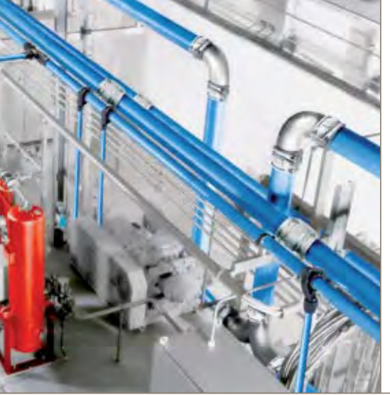
Together, we can move clean air, guaranteed. From the compressor outlets to the machines with optimal flow, minimal downtime and increased plant productivity.

Normally the desiccant is contained in two separate towers. Compressed air to be dried flows through one tower, while the desiccant in the other is being regenerated (Figure 1). Regeneration is accomplished by reducing the pressure in the tower and passing purge air through the desiccant bed. The purge air may also be heated, either within the dryer or externally, to reduce the amount of purge